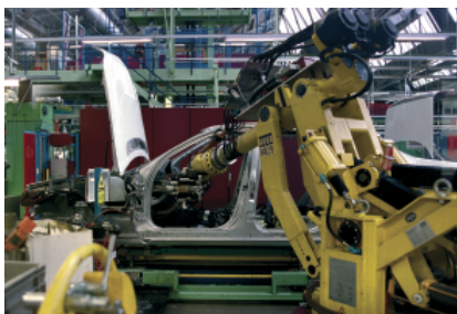
Positioning of robots