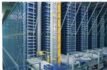
Storage techniques and materials handling