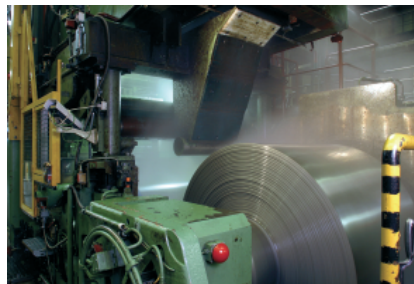
Measurement of coils