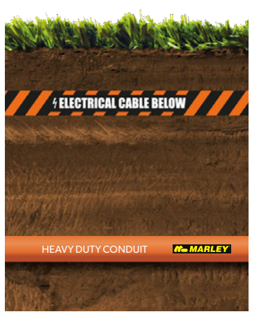
Marley ARMA® Heavy Duty conduit

Marley ARMA® Heavy Duty conduitextra protection not required