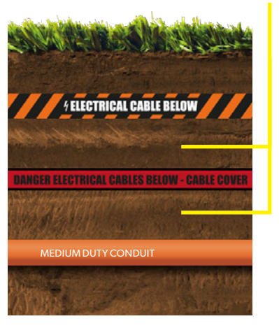
∀S Medium Duty conduit