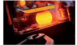
Steel & metal