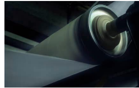
Pulp & paper

Leine Linde encoders and sensors are known for their ability to withstand shock, vibrations, heat, dust, dirt, temperature fluctuations and other impact from mechanical forces. They are trusted in applications where production stoppages are very costly and their condition monitoring and functional safety functionalities are very appreciated. Find encoders with the right mechanics, electronics and certifications at www.leinelinde.com/productfinder .